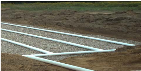
Figure 3: An example of the closed loop system found in an absorption bed.

Environmental Health Specialists design sewage disposal systems based on site evaluations. These evaluations reveal the highest elevation that the zone of saturation has reached in the soil profile. Sewage disposal systems are designed to allow adequate isolation between the bottom of the absorption field stone, and the highest indicated elevation of the saturated zone. This helps to minimize the risk of groundwater contamination by the sewage effluent, because the isolation allows for effective treatment of the effluent, as it passes through the unsaturated zone.