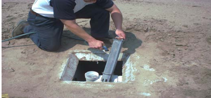
Figure 2: Hosing an effluent filter off into the septic tank

Effluent filters require periodic cleaning, in order to maintain proper flow of sewage effluent from the septic tank to the absorption system. To clean your filter, simply remove the filter cartridge from the outlet baffle or case, and hose the cartridge off, being careful to rinse septage material back into the septic tank (Figure 2 on the right). What you put in your septic system, and how much, will dictate the maintenance interval. Always refer to the manufacturers' recommendations regarding the maintenance of your effluent filter.